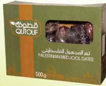
Medjool Dates 500 gr