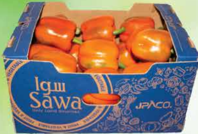
Sweet Bell Peppers