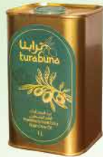
Olive Oil (1L)