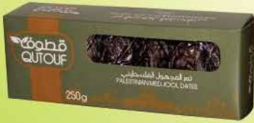
Medjool Dates 250 gr