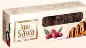
Medjool Dates 250 gr