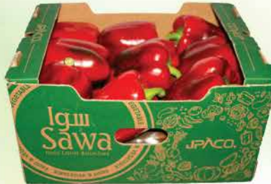
Sweet Bell Peppers