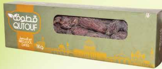
Medjool Dates 1 kg