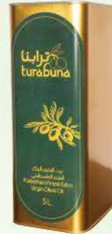
Olive Oil (5L)