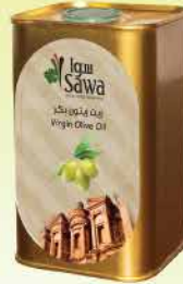
Olive Oil (1L)