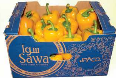
Sweet Bell Peppers