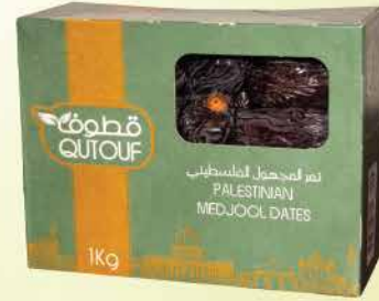
Medjool Dates 1 kg