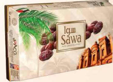
Medjool Dates 1 kg