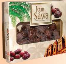
Medjool Dates 1 kg